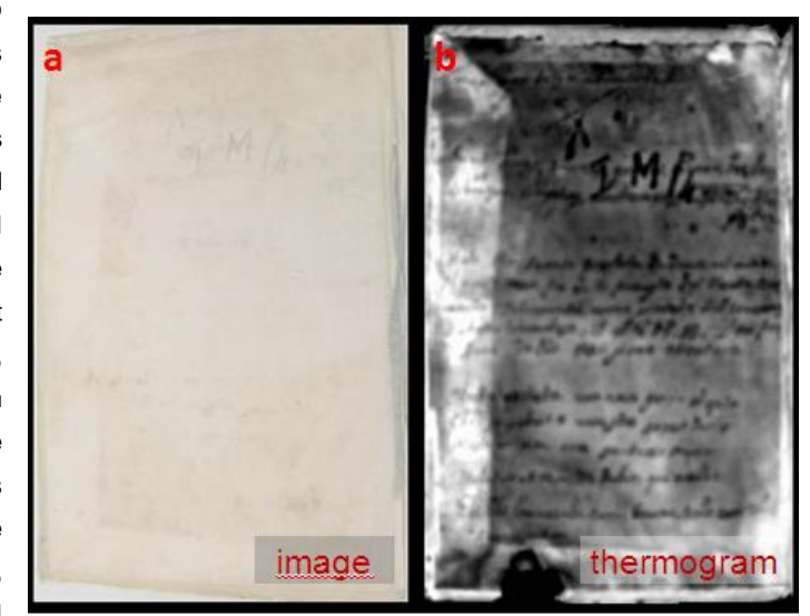
Fig. 1 - Photograph (a) of a seventeenth century volume. The thermogram (b) shows the writing of a leaf beneath the end paper

investigated by active IRT which allows to reveal structural features and inhomogeneities in the materials It provides information on the surface and subsurface structure of the artifacts by analyzing the heat diffusion process induced within the sample by appropriate thermal stimulations and usually produced by the absorption of the light emitted by different sources (lamps, lasers, etc.). More specifically, we report on results obtained by the application of active IRT to the study of a bronze sculpture made by lost wax casting, where the workings performed after the casting on the bronze surface, (repairs, fillings, surface cold working, etc,) are generally concealed under the final polishing and patination [4], and also of different archaeological findings, such as the study of the