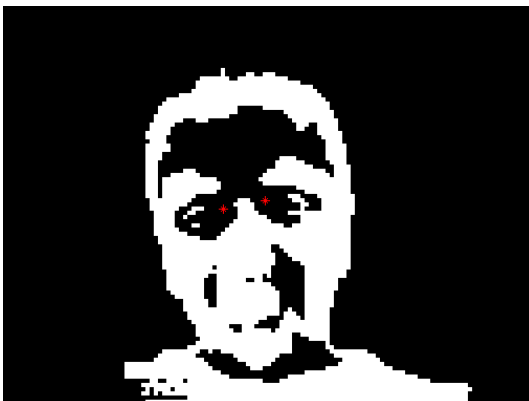
Fig. 1. Determination of the location of the eyes