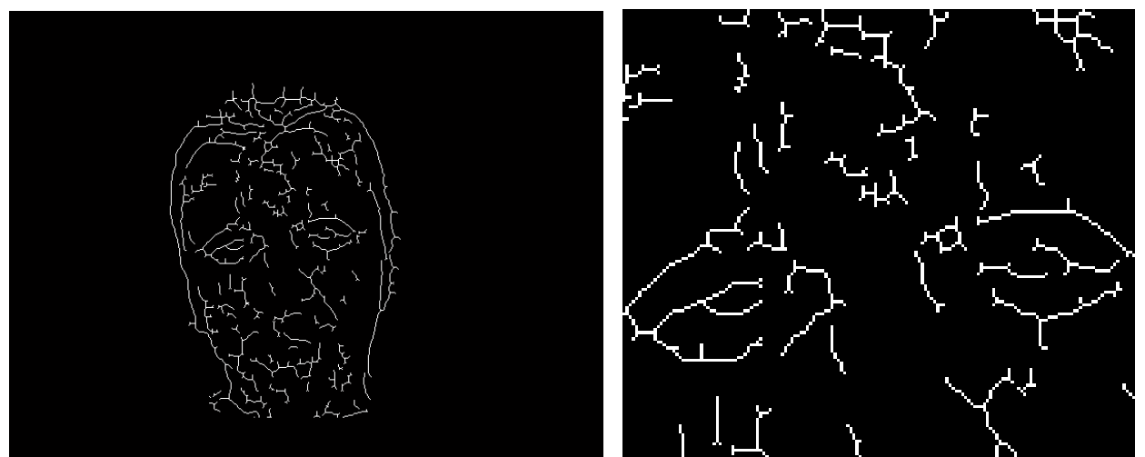
Fig. 2. Contours and blood vessels of the face; contours and blood vessels in the area cropped around the eyes

will result in area with different number of pixels, but it will capture approximately the same regions of the face for every