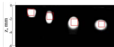
Fig. 2. Black and white representation of the normalized heat source distribution retrieved from experimental data obtained for different depths of a 1 x 1 mm square Cu slab. Real contours in red.

We have prepared samples containing calibrated heat sources by attaching two steel parts with a flat common surface and putting 38 μm thick cooper slabs of known dimensions in-between. When we launch the ultrasounds there is friction between the cooper slabs and the steel surfaces. We take data at a set of nine modulation frequencies mentioned above. In Fig. 2 we show reconstructions of experimental data obtained with 1 mm side square Cu slabs located at different depths introducing raw data in the algorithm and using the isotropic TV model. The reconstructions are very good for squares located down to 2.5 mm below the sample surface.