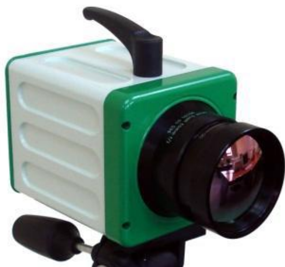
Fig. 7. The first IR camera developed in Poland high sensitive with VOx detector (Lodz University of Technology), [13]