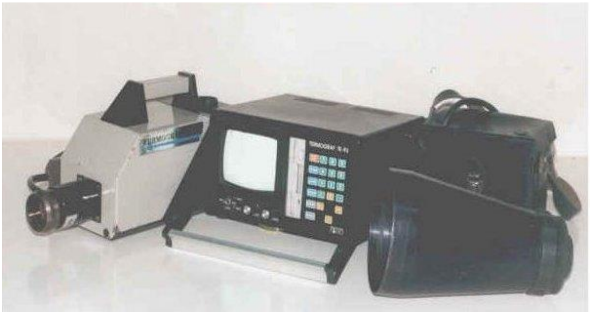
Fig. 5. The first developed in Poland IR cooled scanner, TE-93 (Poznan University of Technology), [14]