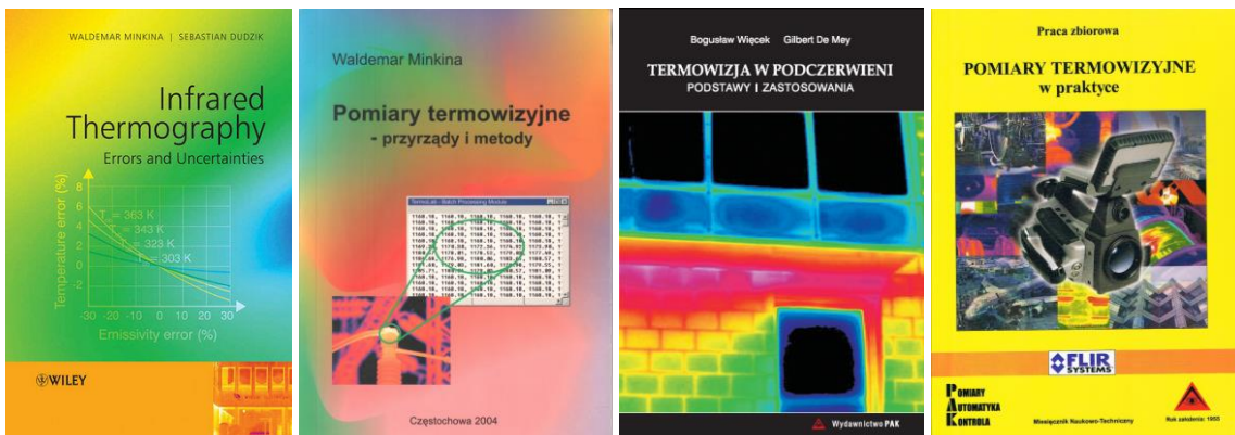
Fig. 2. The books on general thermography