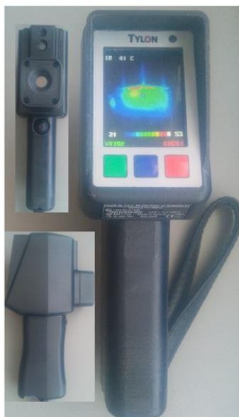
Fig. 8. The first IR camera developed in Poland TIC-PM10 with EX certificate (for explosive atmospheres) [16]