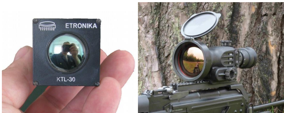
Fig. 9. Miniature bolometer camera and gun sight from Etronika company [17]