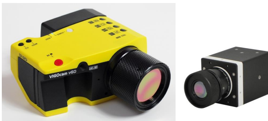
Fig. 10. Hand-held and miniature bolometer cameras from Vigo System SA [18]