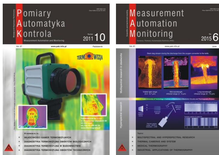
Fig. 1. Two exemplary issues of MAM journal as TTP conference proceedings

In 2009 our IR community decided to create the countrywide nonprofit engineering society – the Committee of Thermography and Thermometry in Infrared (CTTP). The Committee is the part of POLSPAR – Polish Society of Measurement, Automation and Robotics, being the member of worldwide societies IFAC (The International Federation of Automatic Control), IFC (The International Federation of Robotics) and IMEKO (International Measurement Confederation). The main aim the CTTP society is to prepare and supervise the teaching courses and exams for certification the operators of IR equipment for different IR techniques: non-destructive testing, buildings, electrical and energy systems, industrial installations, medicine, etc. Presently, we have more than 50 members.