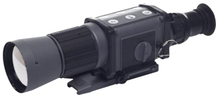
Fig. 6. The first developed in Poland IR sight (Military University of Technology in Warsaw) [15]