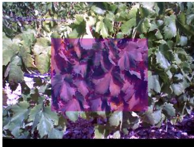
Figure 1 Photo and thermogram of selected grapevines

When using infrared thermography in agriculture, the Crop Water Stress Index needs to be calculated. This requires the canopy temperature, as well as the dry and wet reference temperature, to be determined. In this paper, an overview of possible methods for their calculation and/or measurement is given, and an analysis which compares CWSI values obtained using different methods of determining the canopy temperatures, as well as different dry and wet reference temperatures, is presented. The effect of different methods on the statistical significance of the correlations found are presented and analyzed to determine the most promising method.