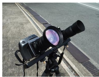
Nippon Avionics 500EX+3.3°lens Figure 2: Measurement apparatus